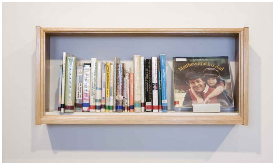
Figure 4. With, Drawn (Collection of Discarded Library Material Curated by Lumi Tan), 2007

Note: Photograph reproduced by permission of the artists, Julia Weist and Mayaan Pearl