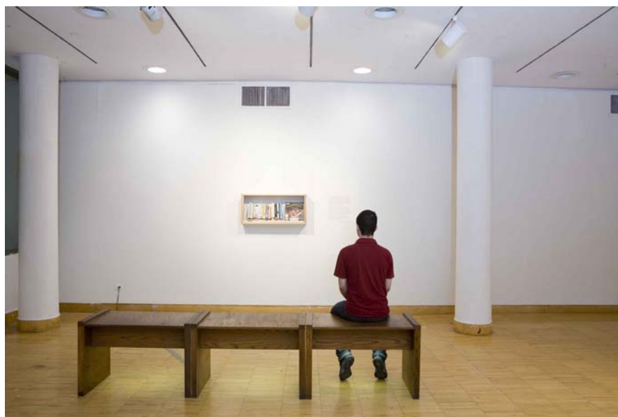
Figure 5. With, Drawn (Sliced Discarded Library Desk Tops as Benches), 2007

Note: Photograph reproduced by permission of the artists, Julia Weist and Mayaan Pearl