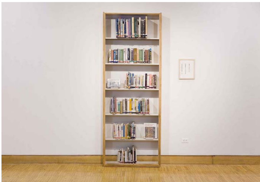
Note: Photograph reproduced by permission of the artists, Julia Weist and Mayaan Pearl