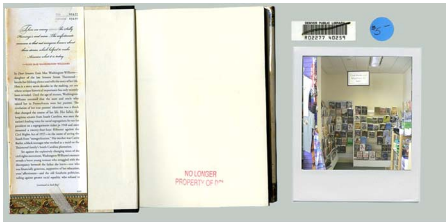
Figure 2. Screenshot of the Denver Public Library collection page, Public Library of American Public Library Deaccession website ( http://deaccession.org/denver.html )

Note: Photograph reproduced by permission of the artists, Julia Weist and Mayaan Pearl